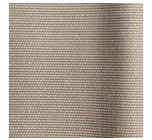
287 Wet Sand Laminate