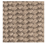
450 Brown Rope