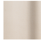
285 Dry Sand Laminate