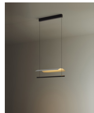
Lámina 45 / 85