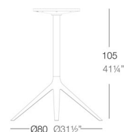
MARI-SOL Pie mesa ø80 cm MARI-SOL Table mesa ø80 cm