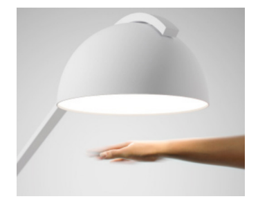
Sensor movement (turn on/off)